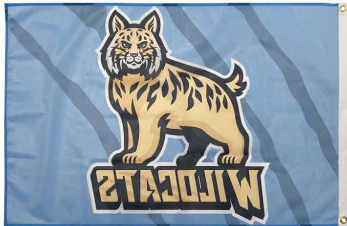
SINGLE SIDED BACK